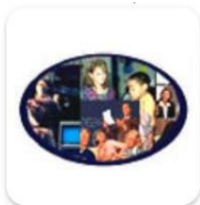
Virtual Counselor (Report Cards)

Virtual Counselor (Report Cards) To view official report cards and interim reports, click Student Info in drop down menu.